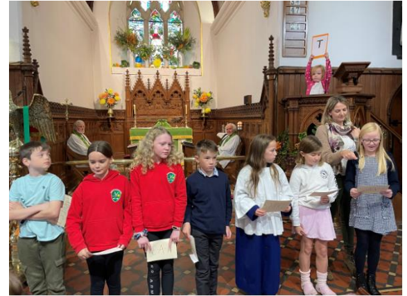
Children who led the Harvest Service in Church.

If you haven't done so already, please feel free to join the Kids Club WhatsApp Group to keep in touch with kids' parish activities and Sunday Kids' Club throughout the year.